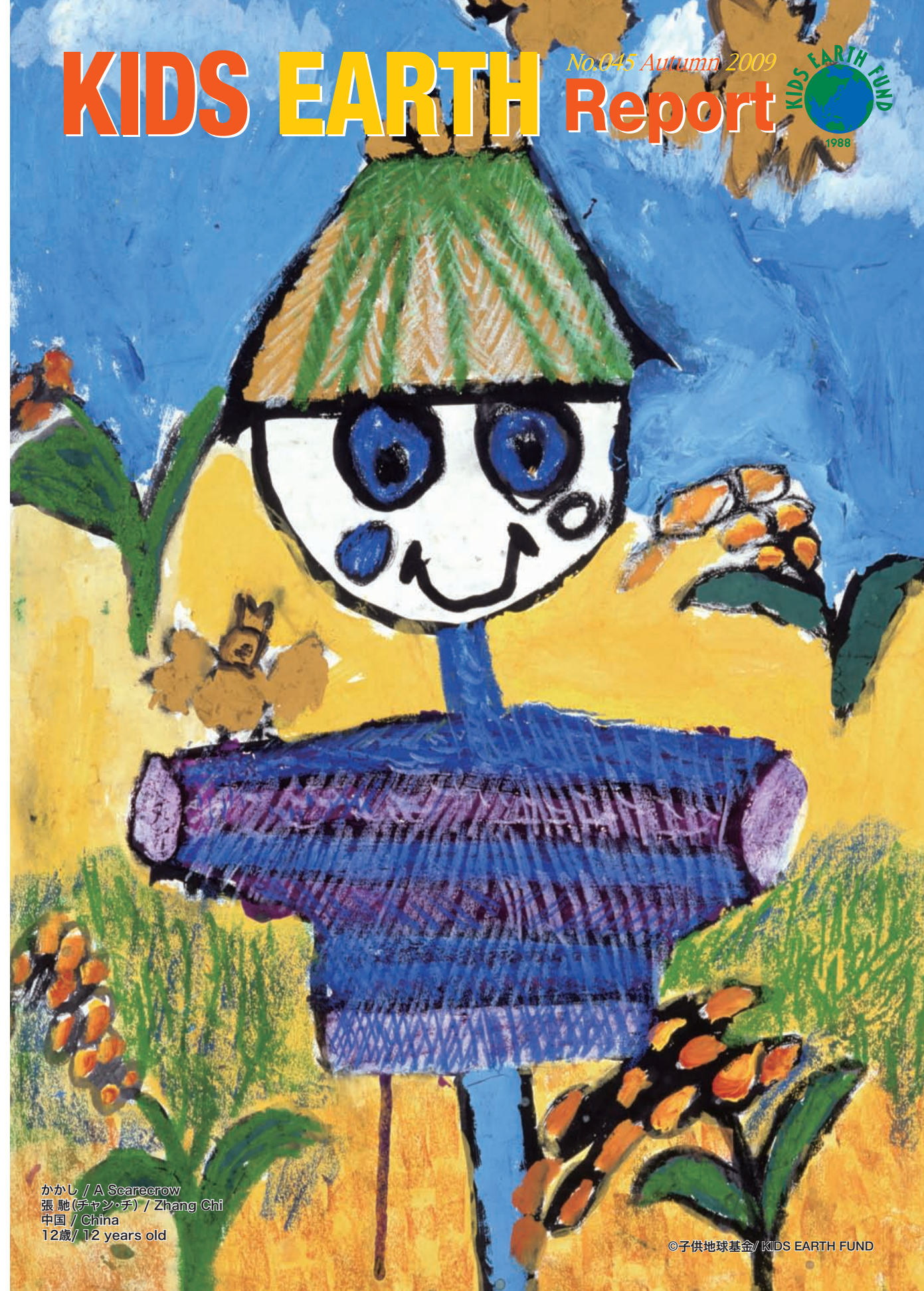
かかし / A Scarecrow 張馳(チャンチ) / Zhang Chi 中国 / China 12歳 / 12 years old