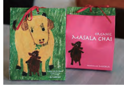
MASALA CHAI ¥650(Tax included)

■ Each of the five Scented Potpourri has its unique aroma in the way their wings are designed. The scent can be exchanged by replacing the small bag inside. We have the "Oriental Dream" with a hint of anise, the "Mischief of the Forest" with a sweet fragrance composed of cornflower as its main scent, the "Whisper of the Grass" with a refreshing fragrance of rosemary, the "Talk of the Flowers" with a relaxing fragrance of rose as its main scent, the "Lover of the Wind" with a masculine scent of cardamom. Enjoy exploring your favorite.