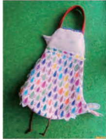
"Bird" Motifed Pouchet - Limited to 1 item. ¥30,000(tax included)