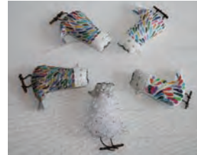
Scented Potpourri Limited to 25 Items ¥1,200(Tax incl.)